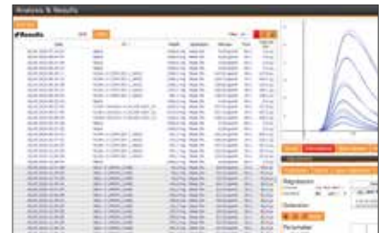
Analysis results after 120-180 seconds