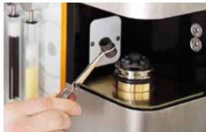
Placing the crucible