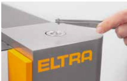
Introducing the sample

All ELTRA analyzers are characterized by their simple operation and quick C/S or O/N/H measurement of powders, granules, wires or foils. After weighing the sample and logging it into the software, all further steps are carried out automatically and the results are provided shortly after the analysis has started.