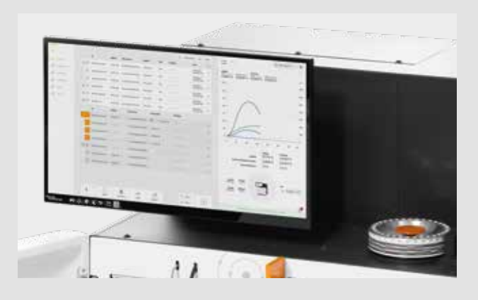
Ergonomic design with integrated PC and tiltable touchscreen