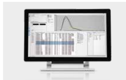
Measurement results and export