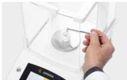
Logging the sample into the software and weighing

Operation of the C(H)S 580 A is simple, fast and convenient. The samples are weighed and registered in the software as manual analysis or analysis via autosampler. Typical sample weights are between 50 and 500 mg. After starting the analysis, the sample is introduced into the furnace and the combustion gases CO 2 , H 2 O and SO 2 are measured in up to four infrared measuring cells. The measurement results can be exported via LIMS, report or text file.