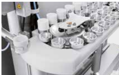
Placement on the autoloader and analysis